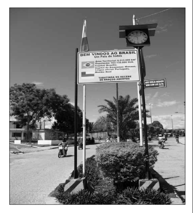
Border marker between Leticia and Tabatinga along Avenida da Amizade (Friendship Avenue).

The paper is organized in five sections. In the first section, I present a brief description of the Tri-Border area, highlighting the paradoxes of distance and proximity as well as the overall political context in which the narratives of groups emerge. The second section discusses the overall policies presented in the MPA and analyzes some of