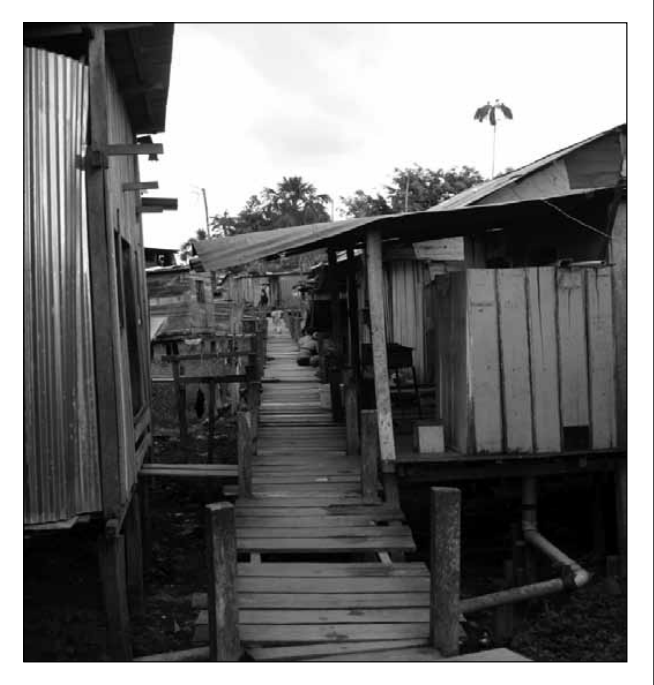
Bairro União (Union Neighbourhood): an occupied area along the borderline between Tabatinga and Leticia. Most of its inhabitants are poor peasants from mixed nationalities and also from indigenous background. In the flood season, water runs beneath the houses along with the garbage and sewage that is throw in there.

The Tri-Border area between Peru, Brazil, and Colombia is located in the heart of the Amazon forest. The main urban centers are the twin cities of Tabatinga, Brazil, and Leticia, Colombia, the latter being the capital of the Departamento de Amazonas. The twin cities are physically joined and blend into each other. Transit and movement are free between the cities, as there is no border controlling post along the avenue that connects them. From the Colombian side, it is only possible to reach Leticia by plane or by a very long and treacherous journey combining paths and boat trips. Tabatinga is connected to the provincial capital, Manaus, some 1,600 kilometres away, by plane—only one flight during business days-or by boat in a three- to five-day journey (depending on the direction, whether up or down the river). Control of goods and people takes place only on the Brazilian side, some 50 kilometres down the Amazon River, in what is called Base Anzol (Hook's Base). The Hook serves as a customs, security, and immigration-processing checkpoint. There, a handful of federal police agents are responsible for checking the documents and cargo of all the boats