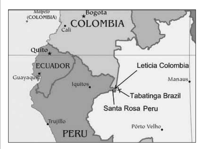
Map of the adjoining cities of Tabatinga, Brazil, and Leticia, Colombia, and nearby Santa Rosa, Peru.

its consequences. The third section discusses the views of assistance workers, in particular, those associated with the Catholic missionaries in the region. The fourth examines the narratives stemming from displaced groups' associations, focusing on the difficulties and strategies of intervention devised by them to advance their claims in a context of social and political abjection. The fifth and concluding section advances a classification of solidarity approaches in relation to borders, stressing the problems and also the positive aspects that might be learned from each set of discourses.