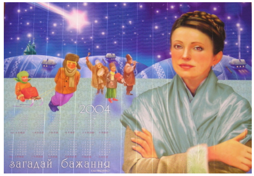
An indoor wall calendar printed by Lviv Regional Branch of the 'Batkivshchyna' Party, Lviv, Dec. 2003

Tymoshenko's portrait resembles the images of female prophets and/ or healers in Ukrainian newspaper advertisements: a straight-looking gaze, a blessing/edifying shape to the hand, and a wraparound purple plait/veil. Such a representation implies Tymoshenko's extraordinary spiritual potentialities. Another controversial image is also reproduced on a Christmas poster (a wall calendar), which I found in a hall in the headquarters. Tymoshenko appears as a fairy able to fulfill dreams: "Make a wish!" the inscription says. The children sledding in the background strengthen the effect of this omnipotent mother-enchantress. Such a fusion of pagan and Christian elements in Tymoshenko's image is quite natural inasmuch as it reflects the syncretism of popular beliefs among Ukrainians, especially regarding the symbolic representation of femininity, as research by Marian Rubchak has demonstrated.[61]