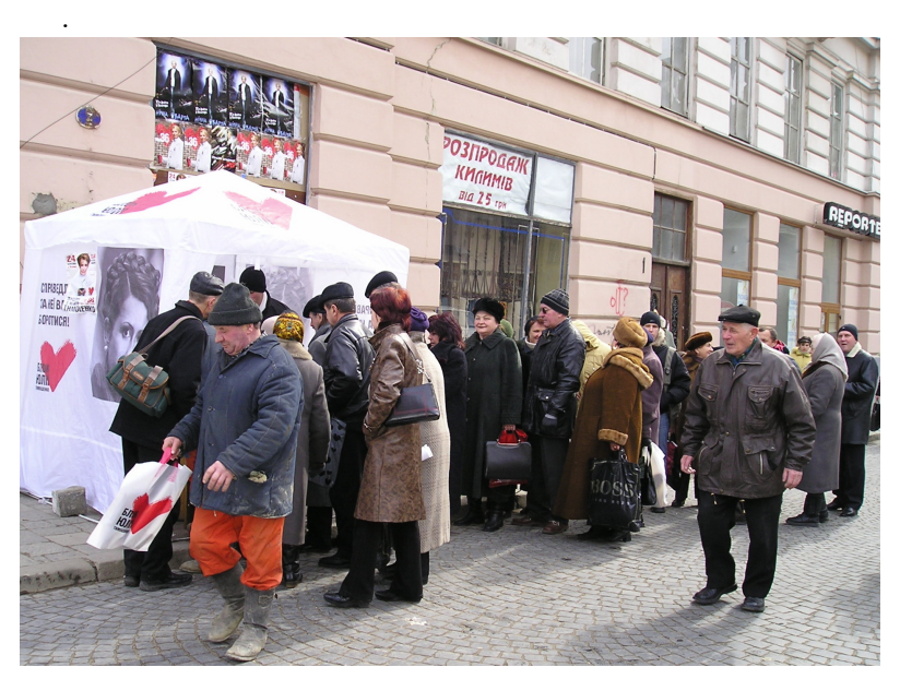
Lviv city dwellers queuing up in front of the Tymoshenko's electoral campaign tent; photo by Oksana Kis, Lviv, March 24, 2006

One can hardly find another politician in Ukraine who produces such a tremendous emotional reaction among citizens (either for or against) as Yulia Tymoshenko. Indeed, Tymoshenko remains very popular in Ukraine as the last parliamentary elections in March 2006 proved: her party's bloc BYuTy won in 13 of 25 regions.[3] In Lviv just before the elections one could observe ordinary people standing in long queues to get a poster or a postcard portraying their idol. Portraits of her made out of amber are sold in fashionable gift shops downtown. As one of the most recognizable symbols of Ukraine, a number of souvenirs depicting Tymoshenko (matryoshka dolls, commercial paintings, handcrafts, etc.) are sold at tourist places