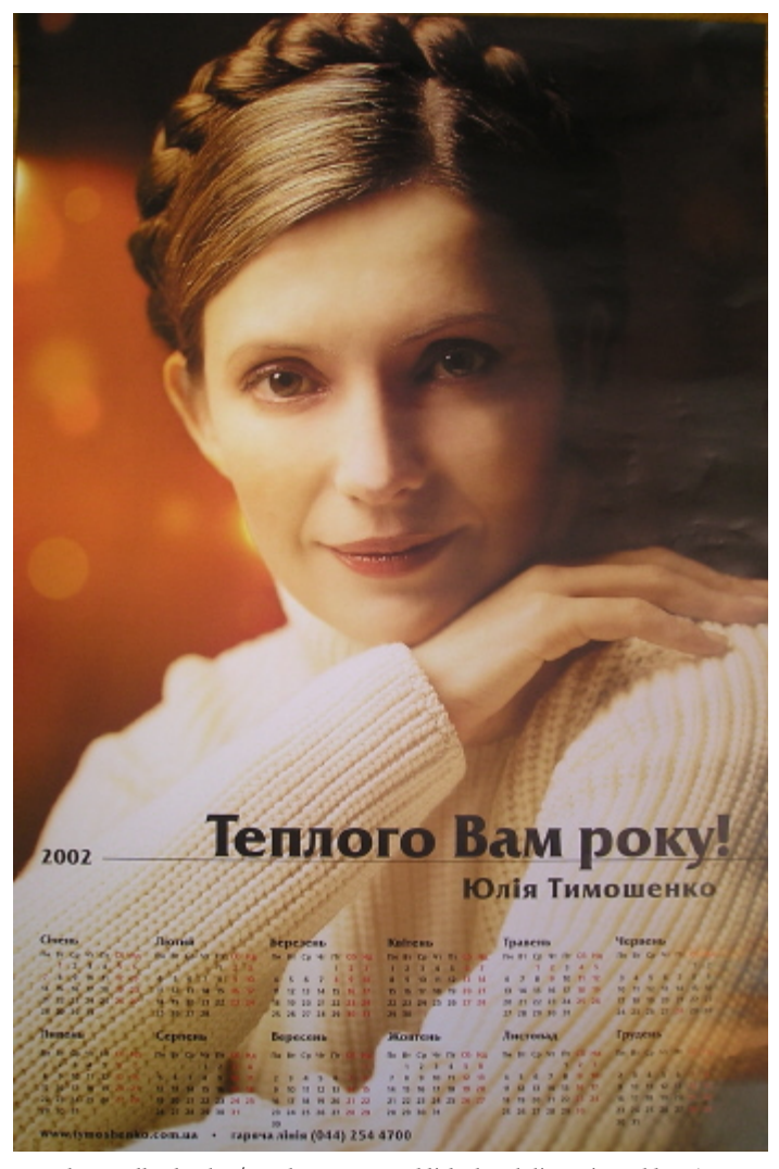
Indoor wall calendar / outdoor poster published and disseminated by BYuTy, Ukraine, December 2002; inscription: "May your next year be warm! Yulia Tymoshenko"

The notion of warmth in Ukrainian popular discourse is deeply associated with a mother's body, especially in conjunction with such words as love, care, safety, good, and peace, which are often present in Tymoshenko's holiday greetings and her party's ads.[19] The new logo of Tymoshenko's 2006 electoral campaign – a red heart against a white background[20] – is a symbolic representation of the idea of selfless and cordial maternal love. Maternal implications are often