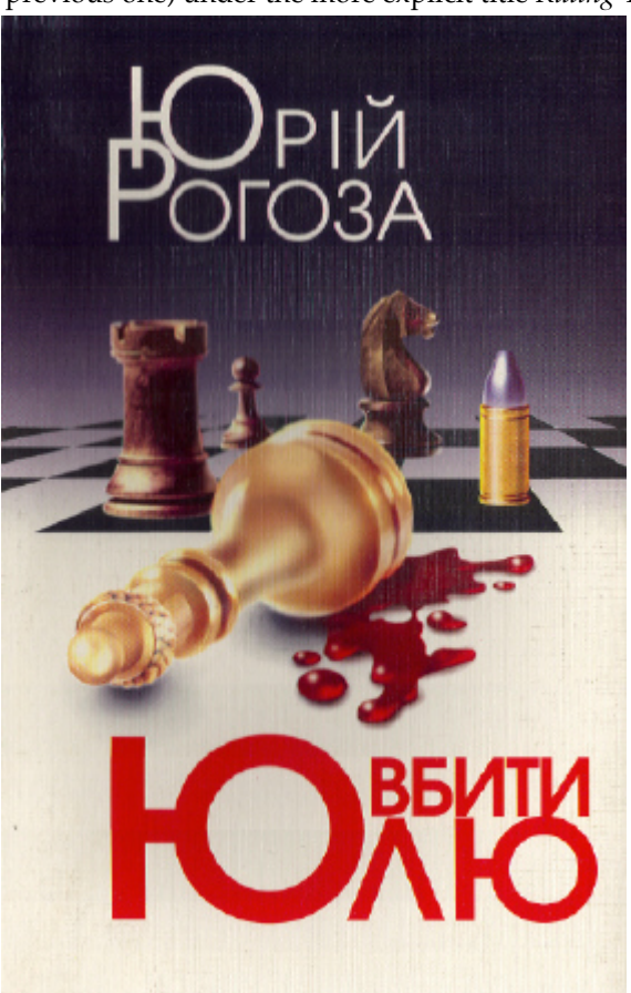
A novel 'Killig Yulia' by Yuriy Rogoza (Kyiv, 2006)

essay with a very eloquent title 'Yulia Tymoshenko's Crown of Thorns.'[45] A detective story by Yuri Rogoza with the even more provocative title The Unperformed Order came out at the same time.[46] The novel relates a conspiracy of high-rank officials aimed at the political assassination of Yulia Tymoshenko. In 2006 the same author published a "non-documentary" novel (which is actually a sequel to the previous one) under the more explicit title Killing Yulia .[47]