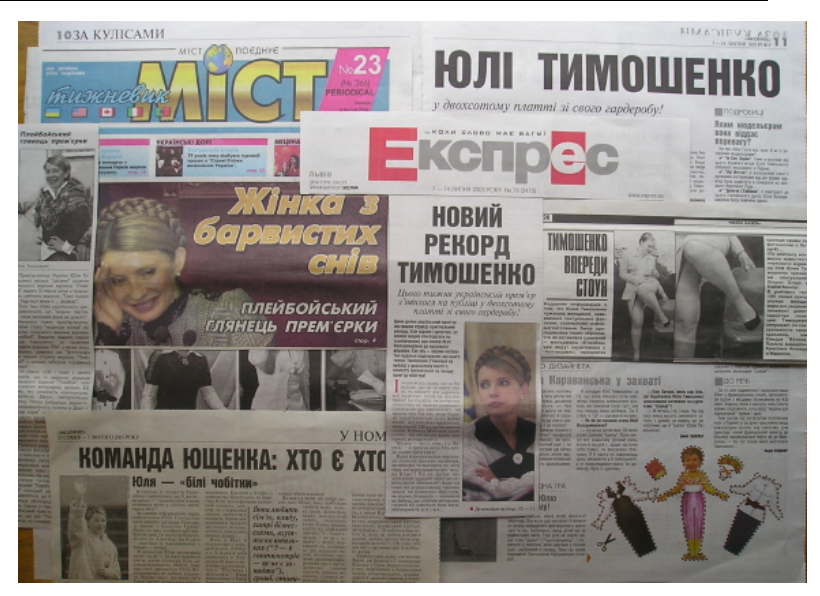
Newspapers' publications discussing Tymoshenko's appearance, 2005

In summer 2005, one newspaper celebrated Tymoshenko's two hundredth dress and devoted two pages to telling readers about her preferences in clothing.[70] Another journalist spent a great deal of time calculating how much Tymoshenko's garments cost. Tymoshenko's enemies have also not passed over this issue in silence. They reinterpreted her stylish image as a mask covering her (allegedly) corrupt, criminal face. The following verse was published in a newspaper associated with the Ukrainian Progressive Socialist Party: