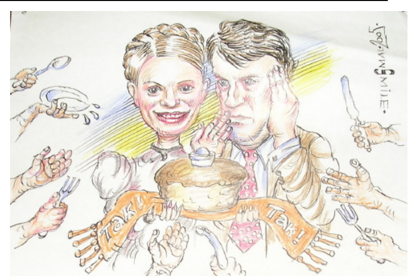
A political cartoon by Oleh Smal', exhibited in Lviv in Dec. 2005

Pictures of Yushchenko and Tymoshenko together taken at a press conference in September 2004 were reproduced and distributed as postcards by the Lviv regional branch of Fatherland . In 2005 this tandem inspired Alexander Roytburt to create a series of paintings depicting Tymoshenko and Yushchenko dancing several romantic ball-dances together. The appearance of Yushchenko in portraits wearing a wraparound plait à la Tymoshenko (e.g., a painting[86] and photocollage[87]) testifies to the monolithic public perception of the two personages.