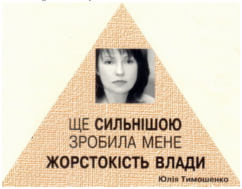
A sticker disseminated during Tymoshenko's detention, spring 2001; inscription: 'The regime's brutality made me even stronger!'

The image of national heroine is occasionally transformed into a variation: that of victim or martyr, something which routinely took place in 2001-2002 when Tymoshenko was persecuted the most. When she was jailed in the course of the 2002 parliamentary electoral campaign, flyers and a booklet picturing her as a victim of a corrupt regime appeared immediately. Those pictures portrayed an ill, haggard and tired-looking female martyr.