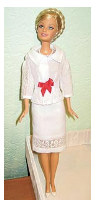
The doll copies of Yulia Tymoshenko sold out by auctions in Mar. and Jul. 2006

In such a context a logical question emerges: if a doll of Tymoshenko can demand such a price, how much would high-ranking men pay to handle the original?