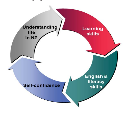
Figure 2. Wheel of progress

order to consolidate these initial gains. Making progress in language and literacy skills is developed through a balance of contextual learning to ensure personal relevance and motivation, but also the teaching of structural aspects of language to ensure correct guidelines for English usage.