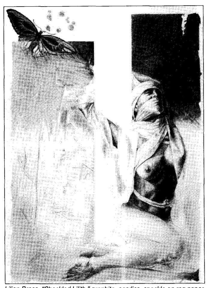
Lilian Broca, "Shackled Lilith," graphite, acrylics, spackle on rag paper, 29" x 22", 1994.

their mates or who fight back can be charged as well.<sup>13</sup> By way of further example, our Criminal Code s.753 creates a process by which a prosecutor can apply to have an offender convicted of a "serious personal injury offence" declared a dangerous offender such that the sentence will