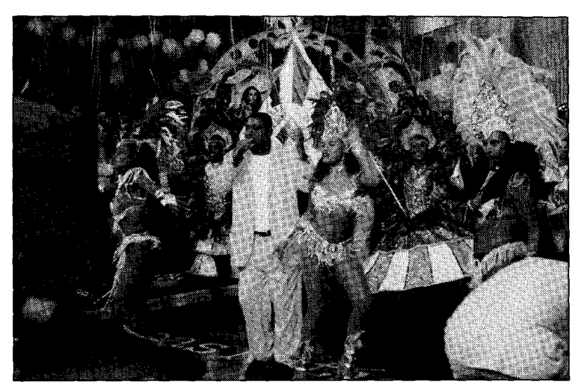
"Passistas, vocalist, flag-bearer, and main male dancer of Grande Rio Samba School at a τν Studio," 1998.

would eventually become Brazil's trademark, representing the nation at home and abroad.