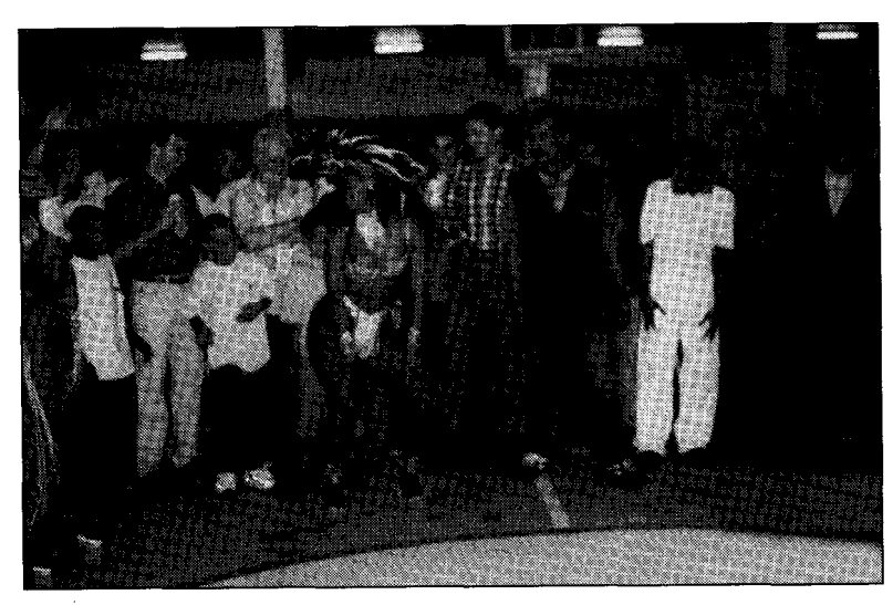
"Passistas from Mangueira Samba School performing the samba for locals and tourists alike." 1998.

Brown woman, is a hot coal ready to burn Burning us with no compassion Go round, brown woman, go, don't go Swing, brown woman, fall, don't fall Dance the samba, brown woman, and scorn me