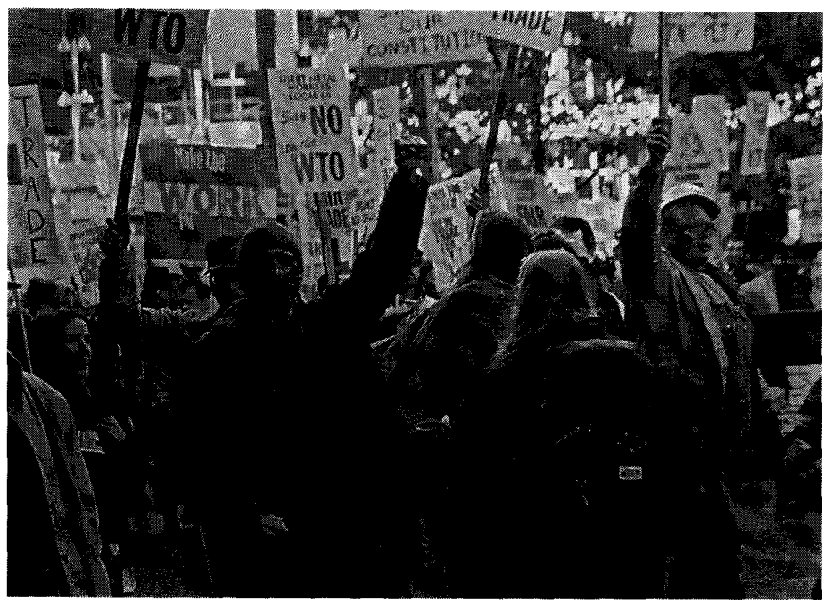
Anti-WTO demostration in Seattle, 2001.

weren't planning to attack the sixkilometre long perimeter sheltering conference delegates from civil society. Aside from a couple of rough nights sleep and potential run-ins with security, what did we have to lose? There were only two women in our group; we agreed to keep an especially close eye on each other and make sure that we didn't get separated. Resisting neo-liberalism was worth it.