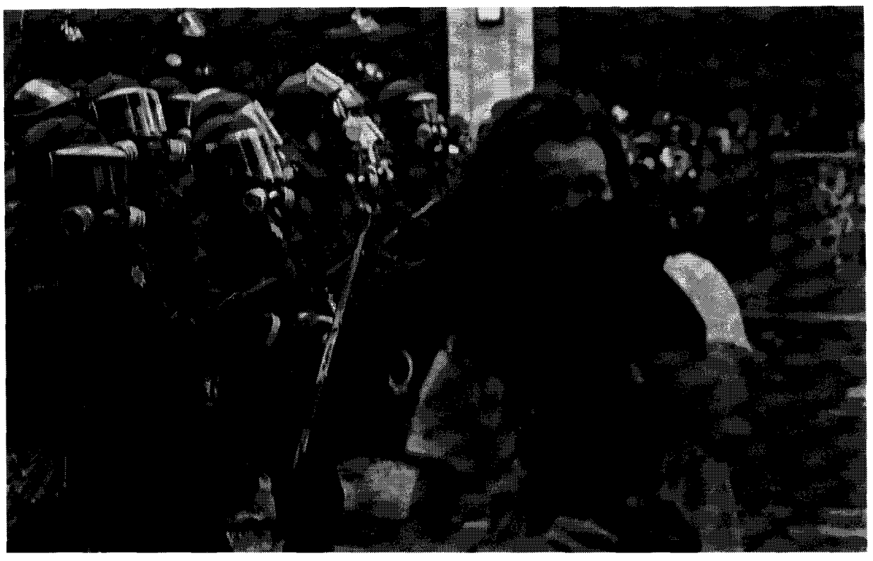
Anti-WTO demostration in Seattle, 2001.

Les mesures de sécurité associées à la résistance à la mondialisation posent de formidables problèmes pour ceux et celles qui contestent ces institutions néolibérales. Au Canada, les contestataires au sommet de Québec en avril 2002 ont été saturéEs de gaz lacrymogènes dont la toxicité sur les humains est inconnue. L'auteure explore la relation entre les gaz lacrymogènes et le développement fœtal.