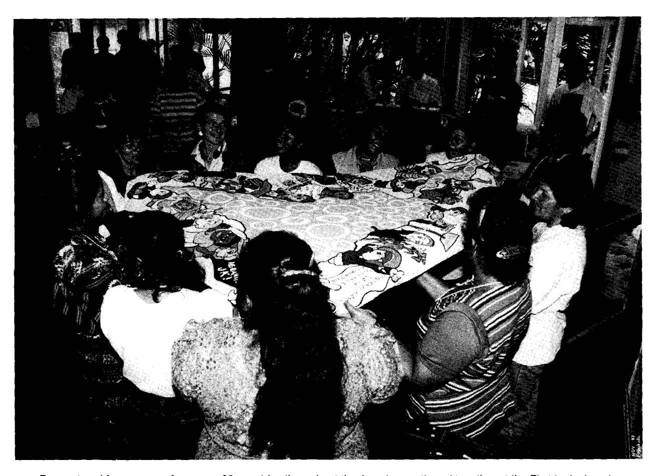
Peasant and farm women from over 23 countries throughout the Americas gathered together at the First Latin American Assembly of Rural Women held in Brasilia, Brazil, November 2-3, 1997.