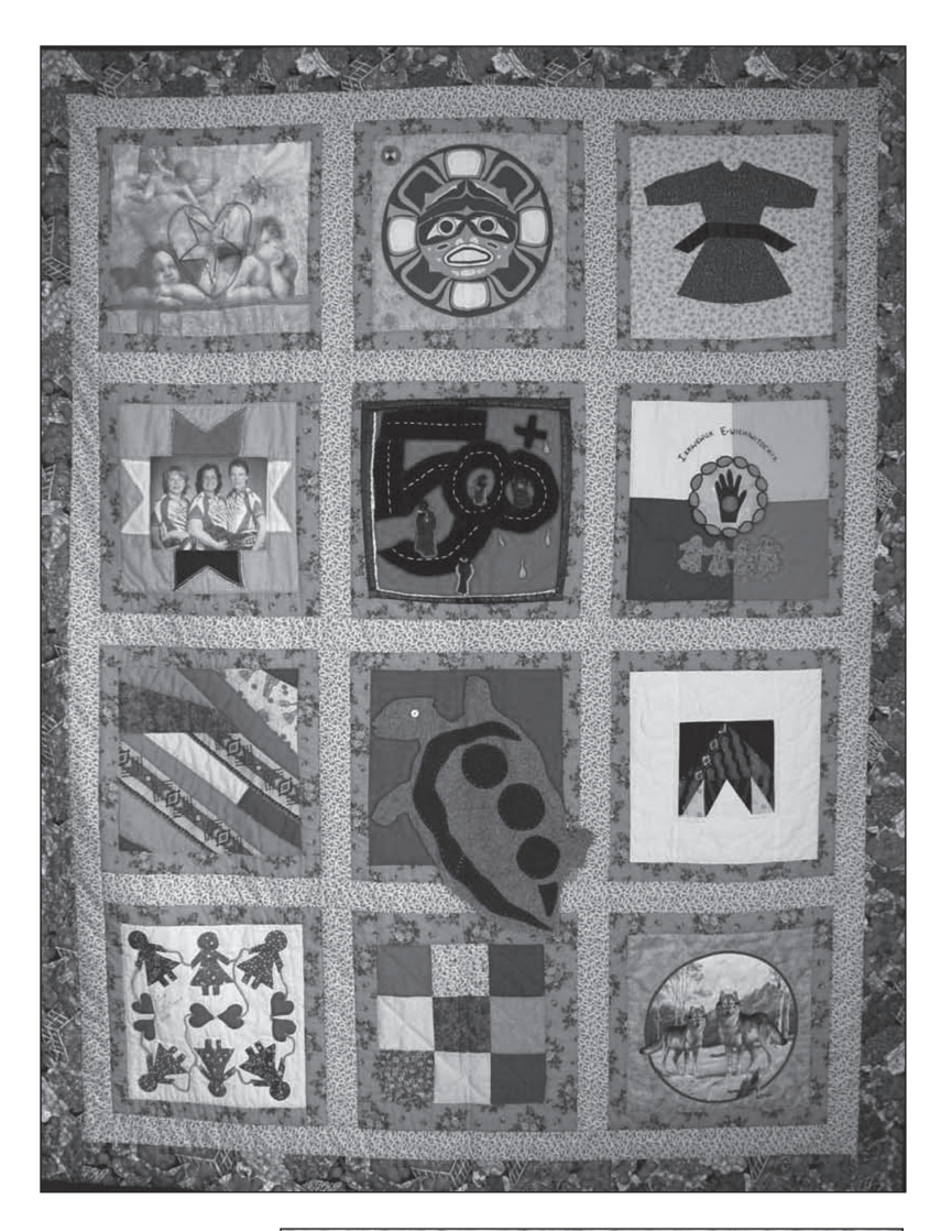
"To the Women Who have Gone Before Us"

What do the other quilt squares represent?