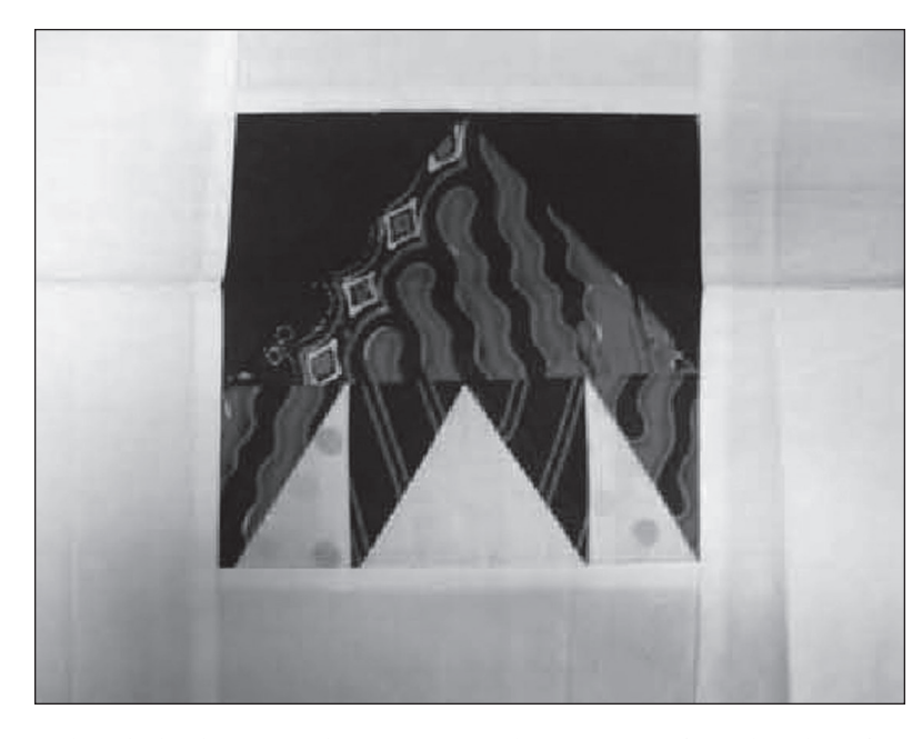
"Thunderbird Totem: Phoenix Rising"